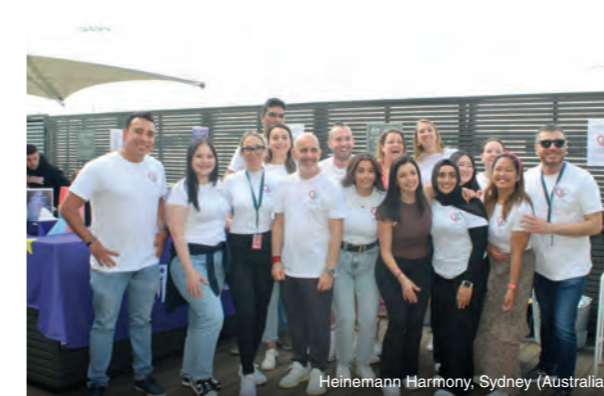
Heinemann Harmony, Sydney (Australia)