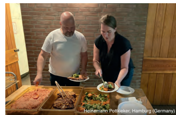
Heinemann Pottkieker, Hamburg (Germany)