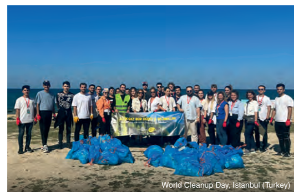
World Cleanup Day, Istanbul (Turkey)

For this reason, Heinemann Harmony has decided to support charitable organizations that appeal to a broad spectrum of the population, focusing on Look Good Feel Better, Starlight Children's Foundation and Gotcha4Life. These charities are committed to helping cancer patients, seriously ill children, and people suffering from mental health problems. Heinemann Harmony supports them through product donations, internal and external charity events, and fundraising activities. The committee also involves travelers: they can now easily contribute to charitable causes by donating an amount of their choice to one or more of the three organizations. To this end, Heinemann Australia has set up permanent donation boxes in central shops in the international terminals at Sydney Airport.